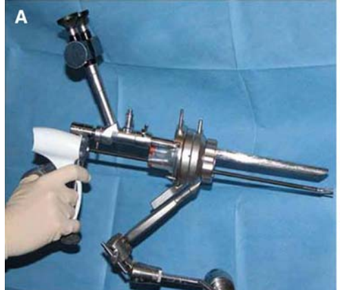
Fig. 2 A HS with rectoscope. B H-LS with rectoscope

Endpoints were operation time, blood loss, and requirement for an additional instrument to complete resection. Operation time was defined as the period from the introduction of the TEM apparatus until completion of the last suture. Morbidity, mortality, and microscopic radicality were recorded as safety parameters. To determine radicality,