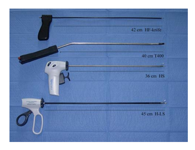
Fig. 1 HF-knife, monopolar diatermia T400, and bipolar instrument HS and H-LS ultrasonic instruments

ultrasonic technology [14, 15]. Several studies, both in vitro and in vivo, suggest that bipolar dissection is safer compared with monopolar diathermia [12, 13] and clinical studies show a reduction of tissue damage and operative time for ultrasonic dissection compared with monopolar diathermia [12, 14, 15] (Fig. 1).