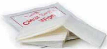
LiNA Clear Sight Wipe

LiNA Clear Sight Wipe is pre-filled with antifog solution and individually packed in a peel pouch. The LiNA Clear Sight Wipe is only available without alcohol.