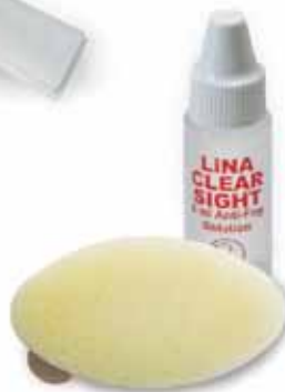
LiNA Clear Sight